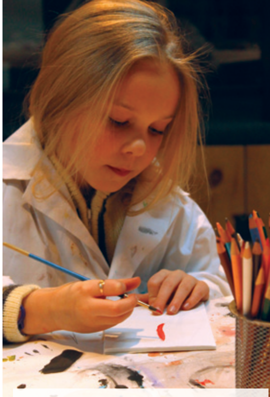
Family Day fun, painting with inspiration from the art of Tom Thompson

It is an organizational goal to continue to build capacity and efficiency and to offer more opportunities for visitors to engage with the Museum and its collections.