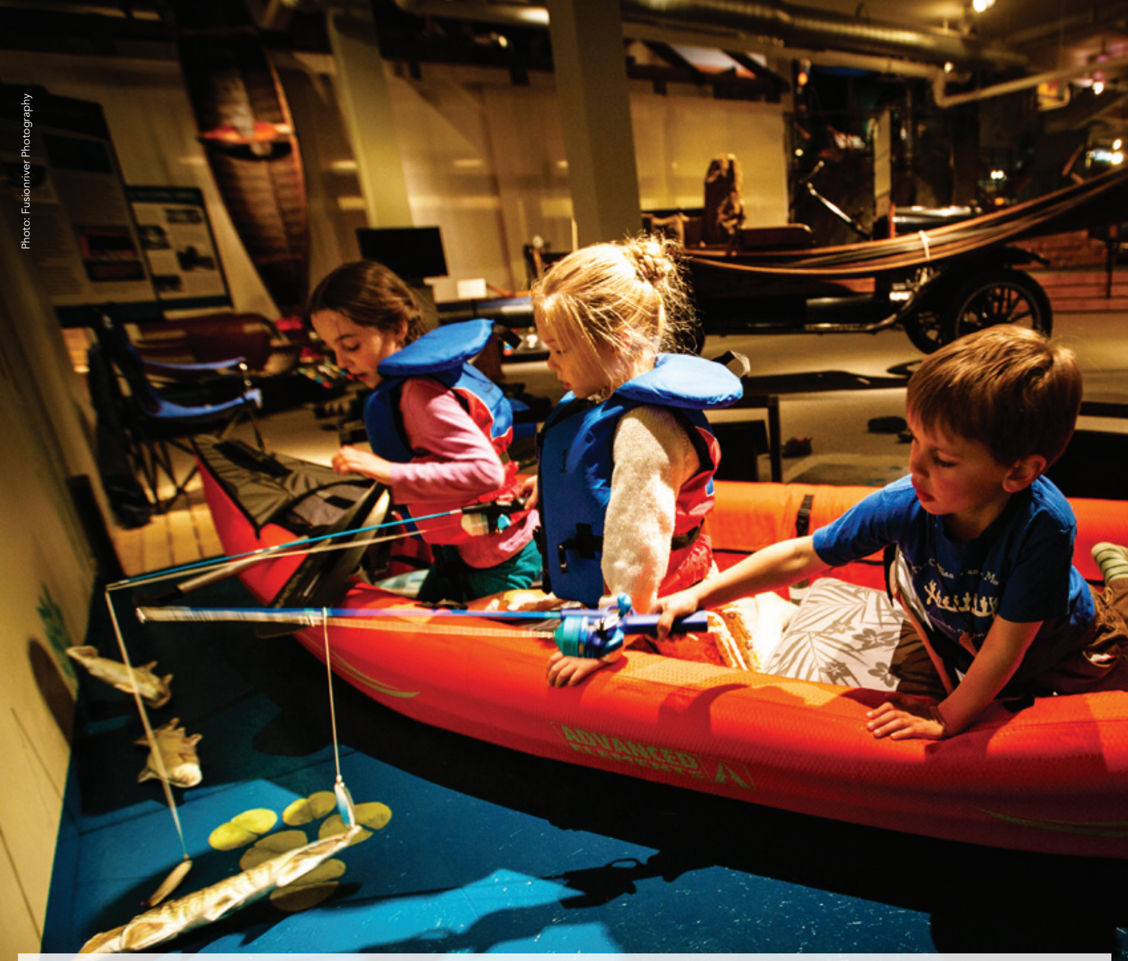
Kids fishing for Canadian fish species in one of the hands-on areas in our Canoes To Go exhibition

... very well presented, with a surprising number of interactive displays & examples of all types of canoes ... Lots of activities for kids, both educational and just for fun, as well as a puppet theatre. Well worth a visit.