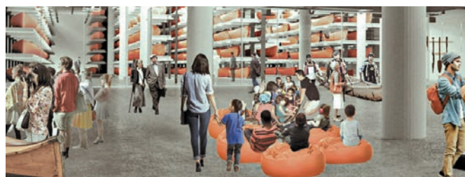
Exhibit Design – Working with GSM Project, we identified the themes of our exciting suite of new exhibits that will honour the cultural histories and stories within the collection. To do so in the best way possible, we have been working to broaden and deepen our collaborative relations with First Nations, Métis, and Inuit close to home and from coast to coast to coast. As part of this process, we visited more than 20 communities on the east and west coasts, and in the far north, guided by the canoes in the collection.

In 2019, planning for our move to the water's edge intensified, as our team of volunteer experts and advisors from across the country continued to work with our board of directors, heneghan peng architects, and Kearns Mancini Architects to lay the groundwork for our new museum and visitor experience.