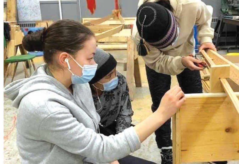
Students in Puvirnituk, Quebec work together to build a local style qajaq (kayak) for the Museum.