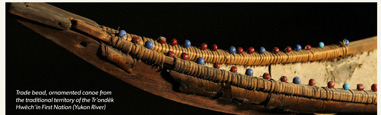
Trade bead, ornamented canoe from the traditional territory of the Tr’ondëk Hwëch’in First Nation (Yukon River)