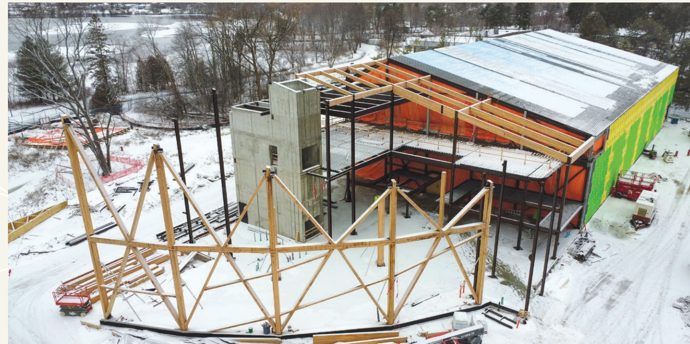
New museum under construction

Our strong relationships from coast to coast to coast resulted in almost $4.5 million in donations from over 700 donors across Canada and internationally. The Museum also received significant funding through all four levels of government in 2022.