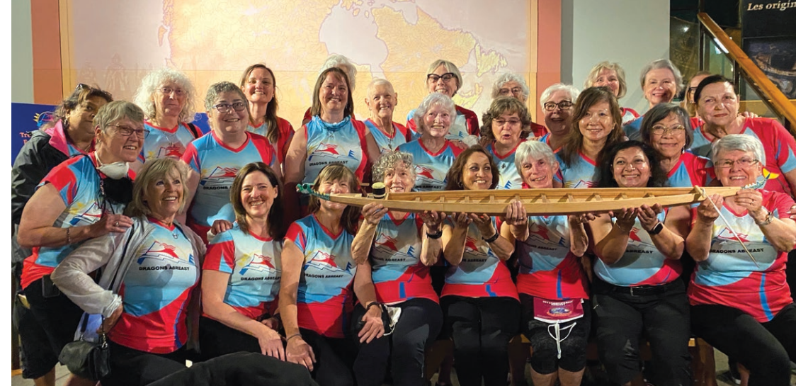
Dragons Abreast Toronto gifts a five-foot model dragon boat to the Museum.